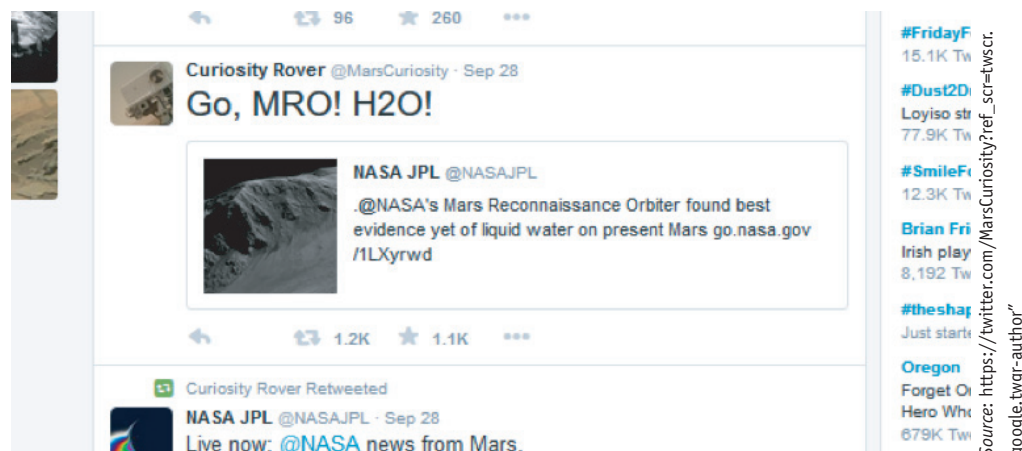
Figure 4.6 The Mars Curiosity Rover Celebrates Its Finding of Possible Water on Mars

Sharing some personality helps build common ground and trust. A bureaucratic or forced tone is not a very appealing call to interact. Instead, building a feeling of trust and common interest makes it more likely that people will find the social media campaign to be engaging and worth participating in.