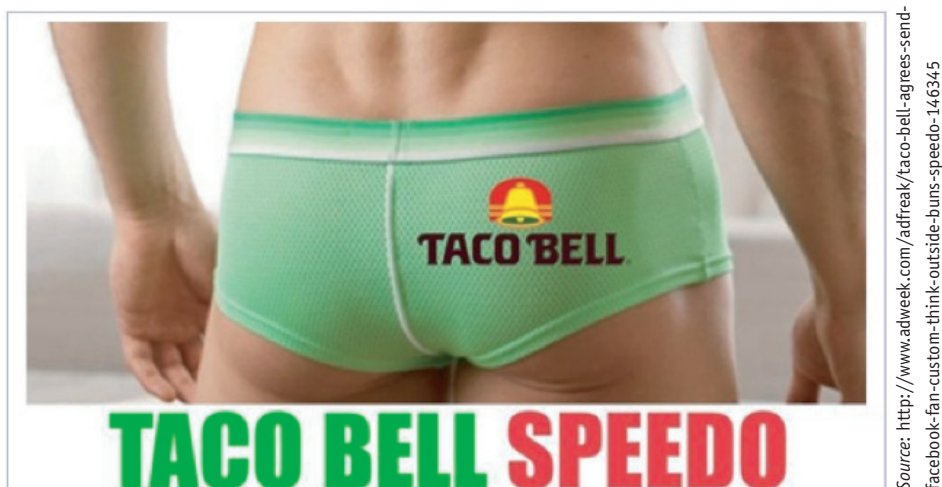
Figure 4.3 The Taco Bell Speedo

Being authentic is vital to the success of any SMM campaign. The Internet spreads information faster than any other means of human communication. A signal can travel around the globe in seconds and reach billions of potential receivers. This rapid spread of information makes deception functionally impossible as a long-term strategy for any company. Sources can come from inside or outside a business, from employees, neighbors, friends, or just from a passerby who hears something. Any single person can quickly broadcast an incriminating secret and reach a larger audience than ever before.