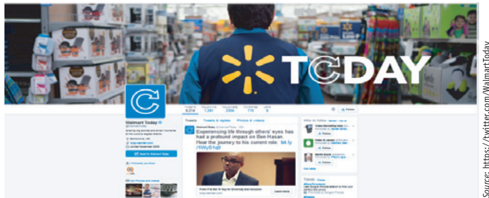
Figure 4.4 The Walmart Today Twitter Hub

This sizeable number of social media accounts paints a picture of a complex business, but even more of a business that has used social media effectively to establish and sometimes to reestablish credibility. On all the social platforms, there is emphasis on the stories of real people—employees, customers, and suppliers—going about their daily lives with the support of Walmart. For the social media marketer, Walmart’s journey of discovery provides a useful model of learning and tenacity in the challenging world of SMM.